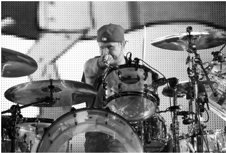
Chad Smith of the Red Hot Chili Peppers