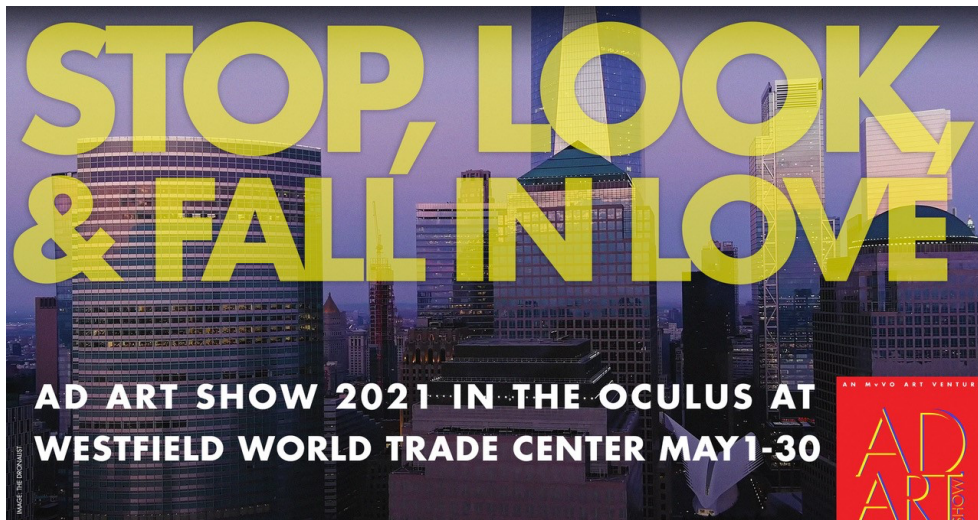
MvVO ART AD ART SHOW at the Oculus at Westfield World Trade Center

The AD ART SHOW brings ART and Advertising together May 3 Virtual Opening with Chad Smith of the Red Hot Chili Peppers NBCUniversal Returns as Presenting Sponsor